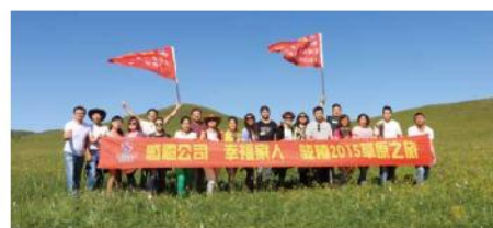
8 | Tangshan Junnan Trade Co., Ltd.